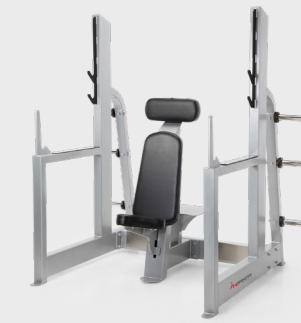
MILITARY PRESS #F216

PRODUCT DIMENSIONS 45 x 62 x 89 in (114.3 x 157.4 x 226 cm)