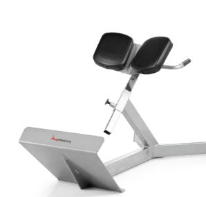
45° BACK EXTENSION #F206

PRODUCT DIMENSIONS 47 x 48 x 93 in (119.3 x 121.9 x 236.2 cm)