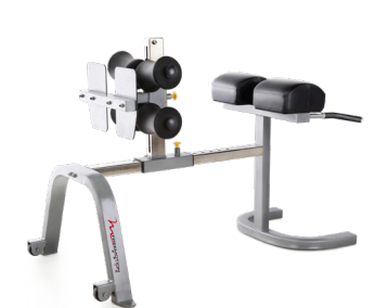
GLUTE-HAM BENCH #F221

PRODUCT DIMENSIONS 40 x 27 x 53 in (101.6 x 68.5 x 134.6 cm)