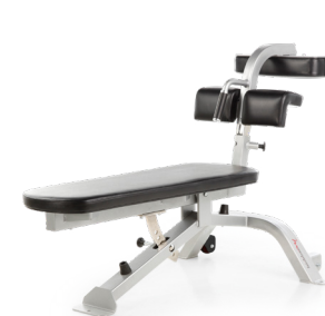
ABDOMINAL BENCH #F213

PRODUCT DIMENSIONS 55 x 29 x 41 in (142.2 x 73.6 x 104.1 cm)