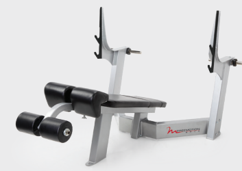
OLYMPIC DECLINE BENCH #F215

PRODUCT DIMENSIONS 63 x 65 x 51 in (160 x 165.1 x 129.5 cm)