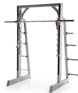
SMITH MACHINE #F211

PRODUCT DIMENSIONS 58 x 69 x 73 in (147.3 x 175.2 x 185.4 cm)