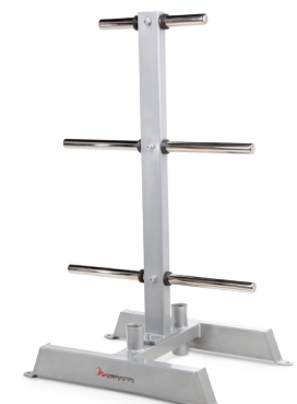
OLYMPIC WEIGHT & BAR RACK #F219

PRODUCT DIMENSIONS 32 x 30 x 52 in (81.2 x 76.2 x 132 cm)