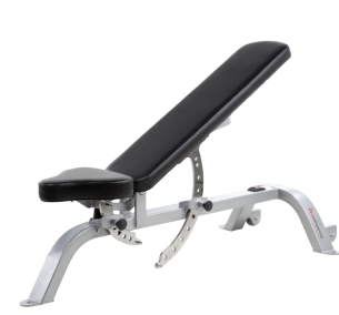
ADJUSTABLE BENCH #F203

PRODUCT DIMENSIONS 55 x 29 x 17 in (139.7 x 73.6 x 43.1 cm)