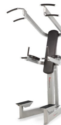
DIP CHIN-AB #F207

PRODUCT DIMENSIONS 59 x 34 x 41 in (149.8 x 86.3 x 104.1 cm)