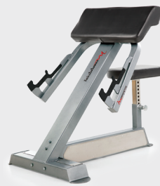
PREACHER CURL #F205

PRODUCT DIMENSIONS 62 x 39 x 44 in (157.4 x 99 x 111.7 cm)