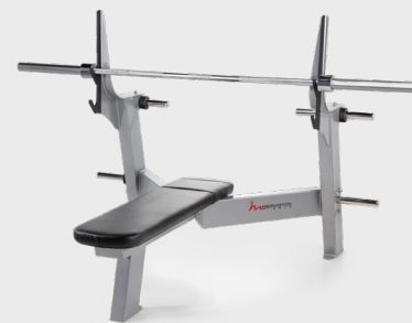
OLYMPIC FLAT BENCH #F202

PRODUCT DIMENSIONS 40 x 30 x 40 in (111.7 x 76.2 x 101.6 cm)