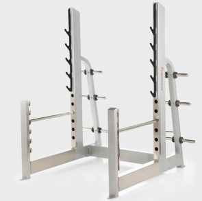
OLYMPIC SQUAT RACK #F212

PRODUCT DIMENSIONS 52 x 73 x 70 in (132 x 185.4 x 177.8 cm)