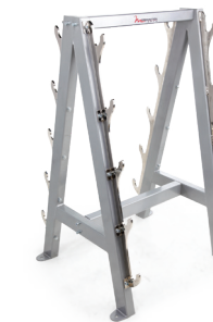
BARBELL RACK #F210

PRODUCT DIMENSIONS 30 x 91 x 31 in (76.2 x 231.1 x 78.7 cm)