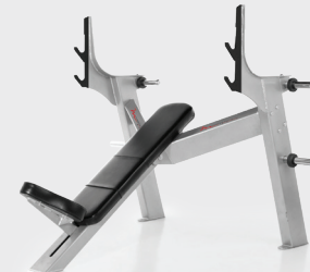
OLYMPIC INCLINE BENCH #F214

PRODUCT DIMENSIONS 64 x 65 x 51 in (162.5 x 165.1 x 129.5 cm)