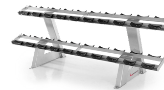
TWIN TIER DUMBBELL RACK #F209

PRODUCT DIMENSIONS 82 x 69 x 58 in (208.2 x 175.2 x 147.3 cm)