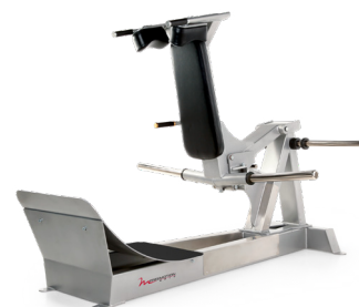
PLATE LOADED SQUAT #F217

PRODUCT DIMENSIONS 56 x 91 x 94 in (142.2 x 231.1 x 238.7 cm)