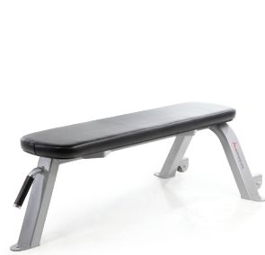
FLAT BENCH #F201

Seats are made with high-quality vinyl and 1.5 in (3.8 cm) foam for comfort and durability.