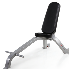
UTILITY BENCH #F204

PRODUCT DIMENSIONS 58 x 28 x 51 in (147.3 x 71.7 x 129.5 cm)