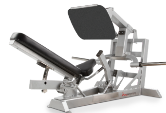
PLATE LOADED LEG PRESS #F218

PRODUCT DIMENSIONS 75 x 57 x 68 in (190 x 144.7 x 172.7 cm)